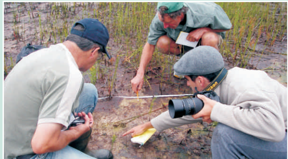
ACPF plant survey

Habitat: Peaty or sandy areas along lakeshores, including peaty wetlands that border the lake. It can be found floating on vegetative mats that have dislodged from the shoreline. Interesting point: This species is only found along 5 lakeshores in NS (and Canada!). Similar species: There are 12 spikerush species in NS which all look very similar and are typically identified by comparison of the mature fruit. Tubercled Spikerush can be distinguished from other spikerushes due to its large, wide fruit.