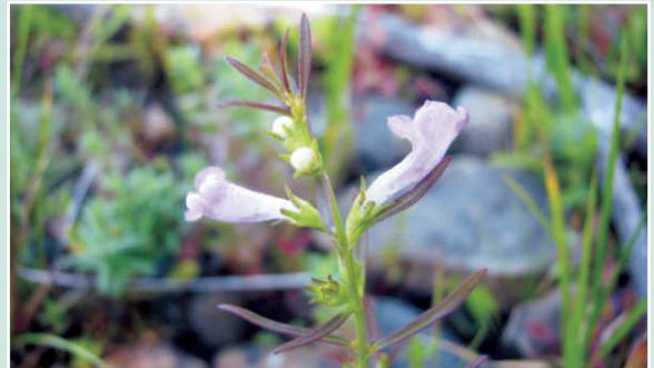
Fruit and flowers