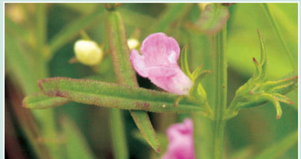
Straight, narrow leaves

Saltmarsh False-Foxglove ( Agalinis maritima , page 1) has flowers mostly along the main stalk near the top of the plant, blunt-tipped (versus pointed) sepals, narrower and thicker leaves, and is restricted to salt marshes.