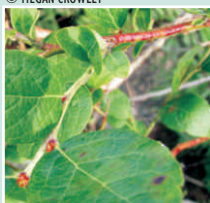
Old and new twig growth