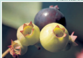
Ripe black and unripe, green fruits