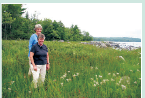
This guide was written for landowners so that they can learn more about the ACPF species they share their land with.