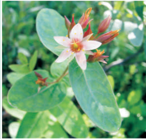
Virginia Marsh St. John's-Wort